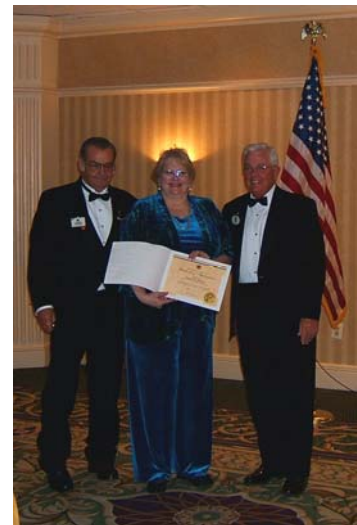
(I didn't plan for the halo, but nice touch isn't it?)