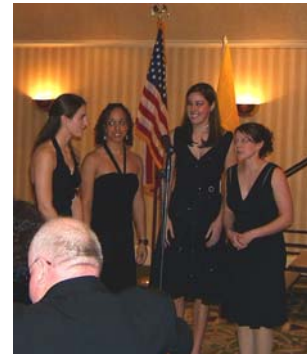
Entertainment by the Naval Academy Sirens