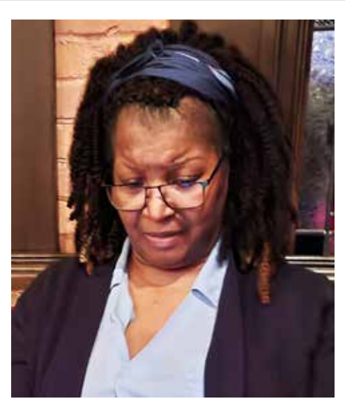
King Lion Joinette Smallwood