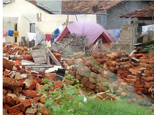
SRI LANKA - Devastation and Rebuilding