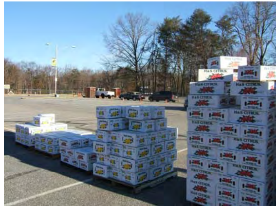
Customers line up (in the background) to pay for their fruit