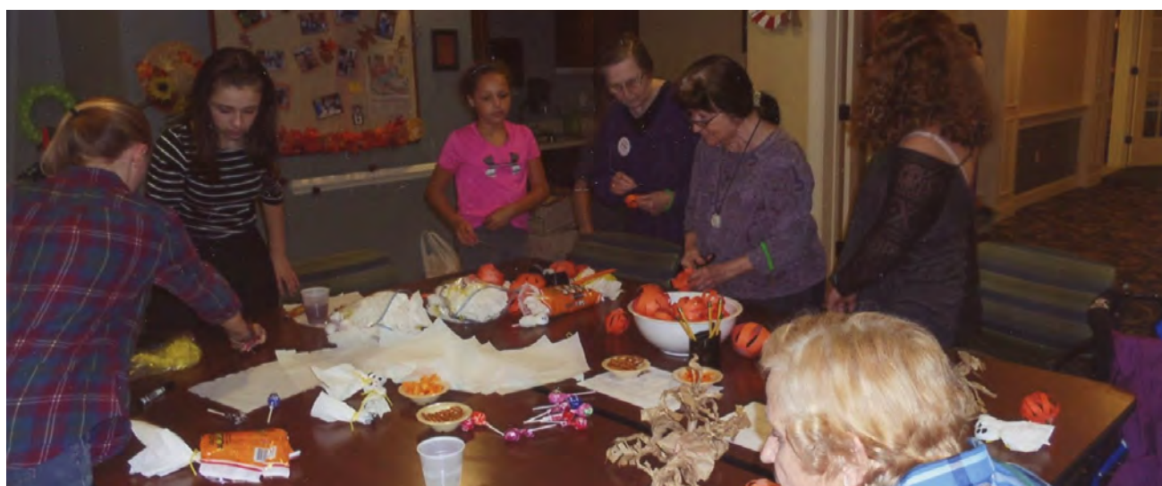
Halloween crafts party at Brightview retirement home