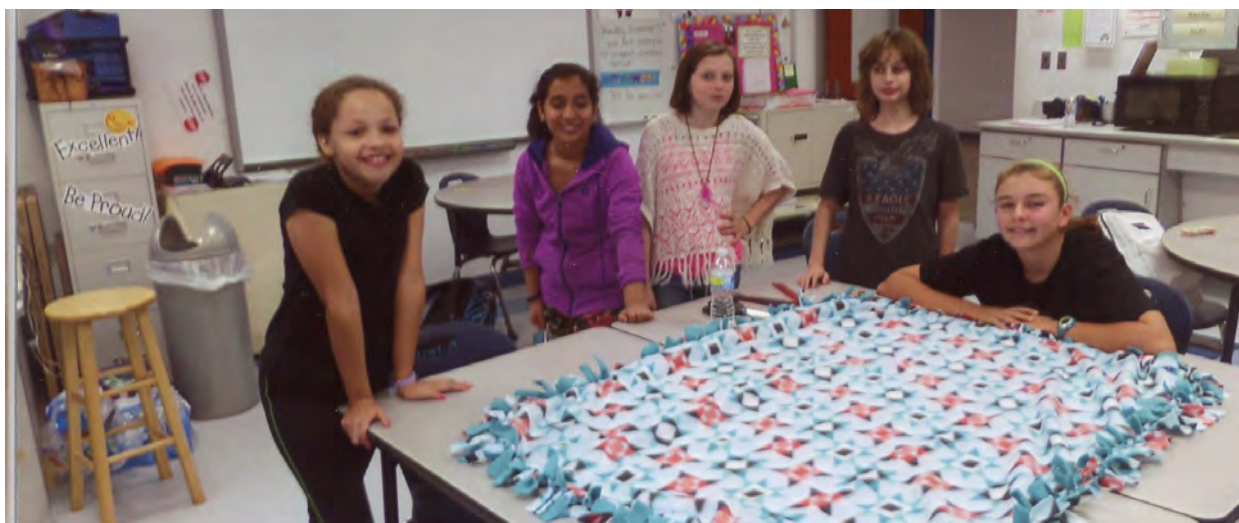
Quilt made by SPMS LEO's for a nursing home resident