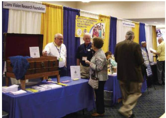
Lions Vision Research Foundation display in the vendor room.