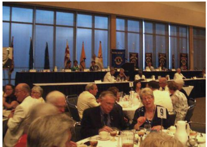
Attendees enjoying Lions fellowship at the formal dinner.