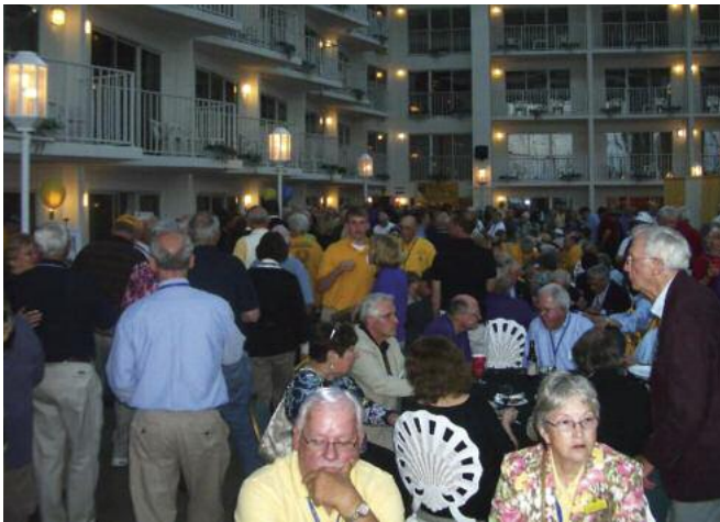
VDG Dinner was well attended, and gave Lions a chance to socialize with members throughout the multiple district area.