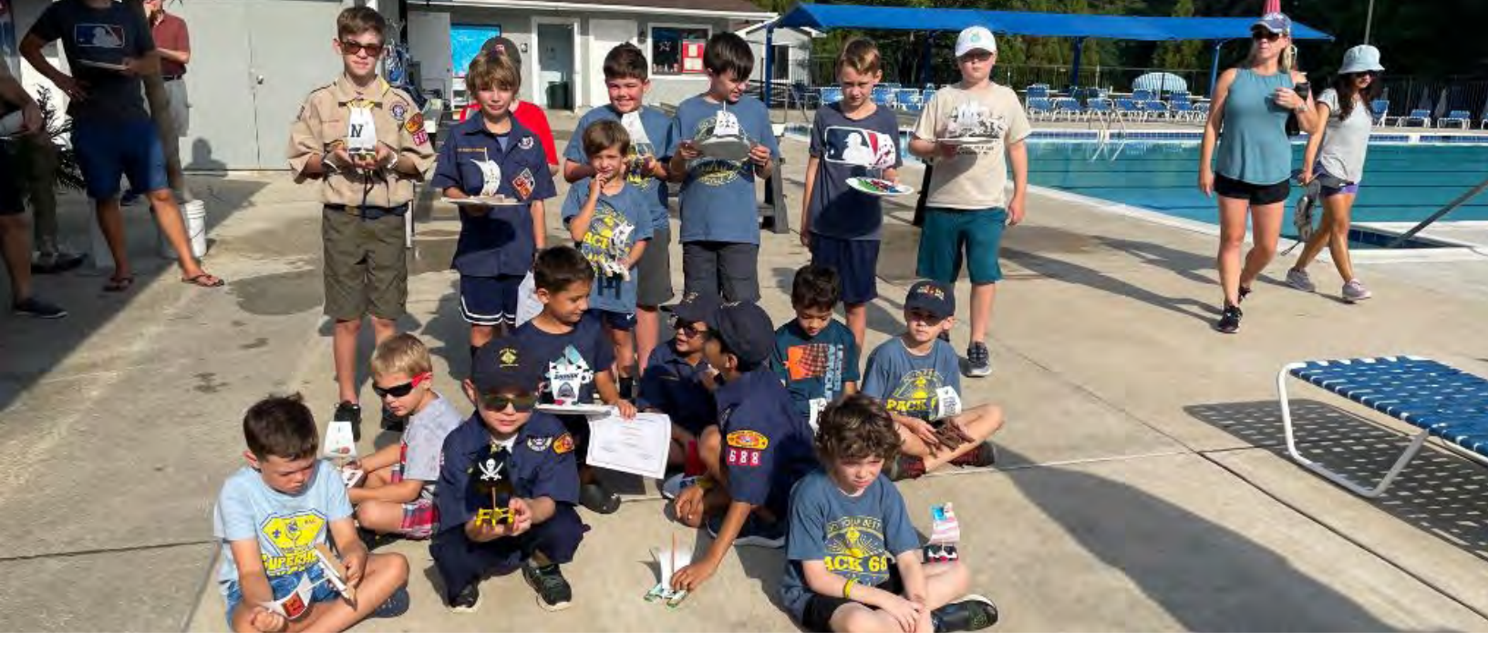
Raingutter Regatta participants and winners