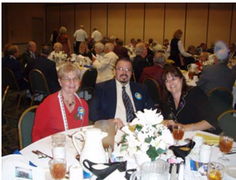
Our friends from West Arundel attended their first full cabinet meeting since receiving their charter.