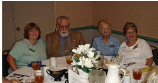
While our friends from East Anne Arundel are anticipating the celebration of their 60 th Anniversary.