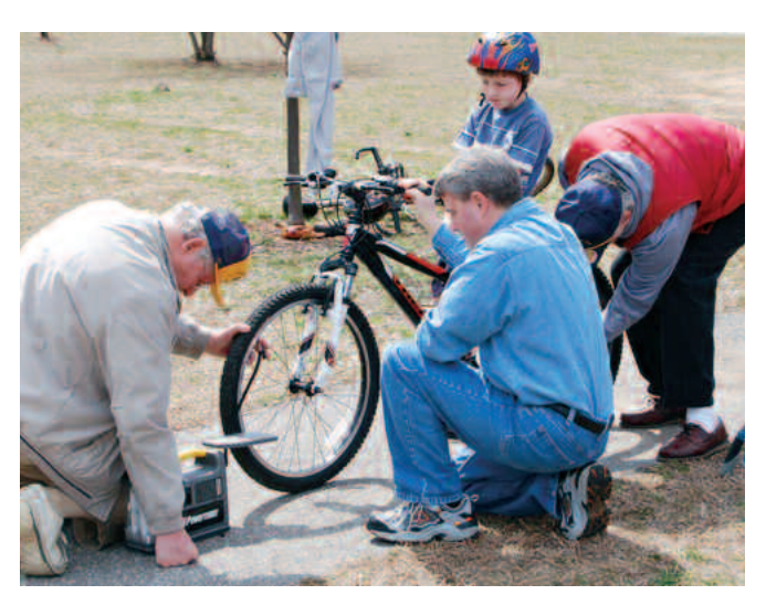
The pit crew inspecting a bike.