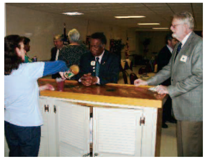
Libations were available at the bar.