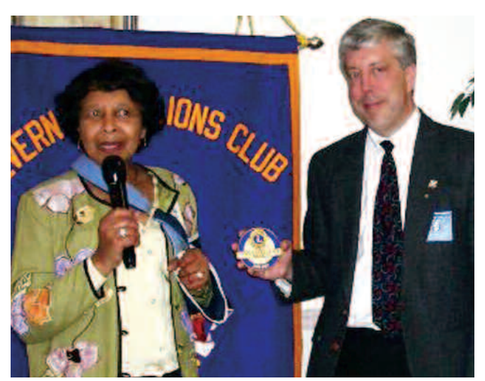
IPDG Senora presents the 100% Presidents banner patch.