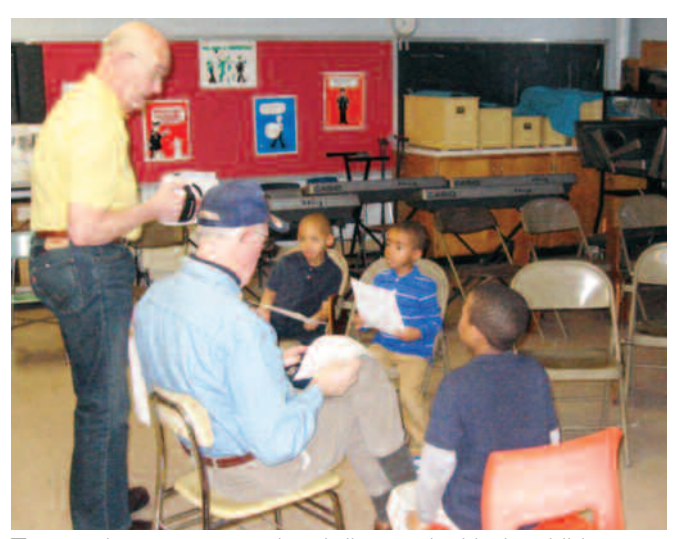
Test results are presented and discussed with the children.