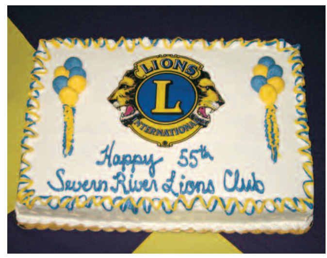
The SRLC 55th Charter Night celebratory cake.

Happy 55th Anniversary Severn River Lions Club!