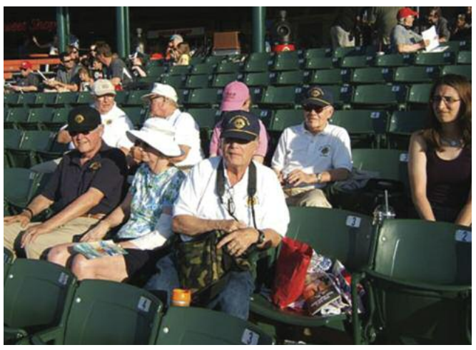
SRLC Lions at the Bowie Baysox game.

The ground crew prepared the field for the second game and fans took this opportunity to visit the snack bars for food and liquid refreshment. Mother Nature cooperated that evening with cooler temperatures and Lions were able to socialize comfortably throughout the games. "Play Ball" was heard and the teams took the field for the second game. Bowie played more aggressively and managed to put two runs on