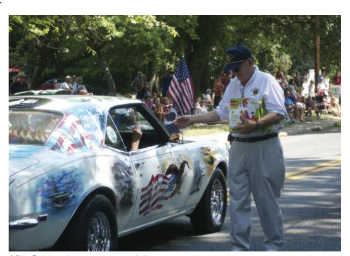
SRLC handing out popsicles.

As the event wound down the lions performed another "community service" by collecting the filled trash containers and transporting the bags to the dumpsters. It was a very hot July 4th parade but the marchers and spectators endured and helped America celebrate another birthday. Happy July 4 and see you next year.