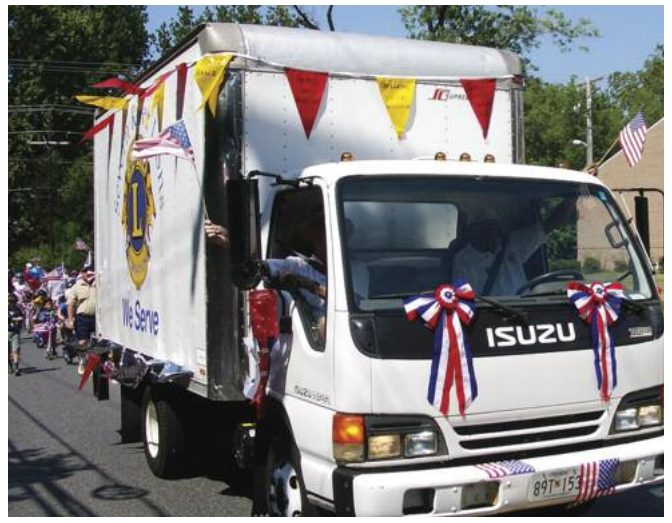
SRLC truck festooned in gala colors was on display.