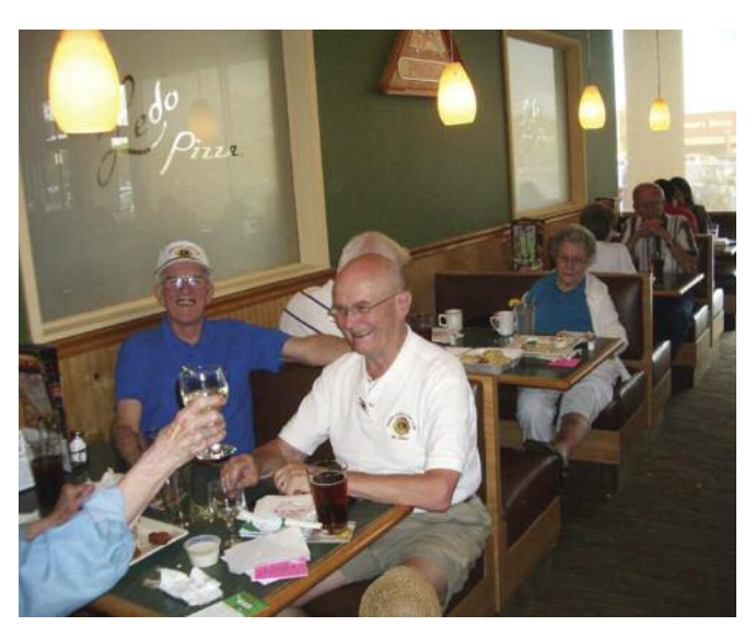
SRLC Lions enjoy a delicious Ledo's dinner on August 22nd.

If you like delicious pizza and other Italian delicacies, then mark your calendar for the fourth Wednesday of each month to visit LEDO Pizza in Severna Park for an evening of good food and comradeship. That Wednesday is "kids night," so you can expect a lot of families to turn out to dine. Not only is the food and conversation good, LEDO donates a portion of the proceeds that evening to SRLC and these go to support the club's scholarship program. This is a great opportunity to mix and mingle with other Lions and community members and provide information about our club's many services. Be sure to mark your calendar for September 26, the next SRLC Night at LEDO Pizza. See you there. Go Lions!