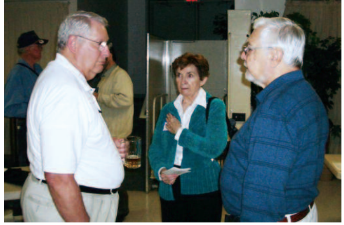
Prospective members were warmly received.

Don't Forget...Ledo's Pizza Night is the 4th Wednesday of each month! The Ledo's Pizza in Severna Park will donate a portion of sales to the SRLC, plus kids eat free too! December 22nd • January 26th • February 23rd • March 23rd It's easy to help raise money, just stop by and get a slice of pie!