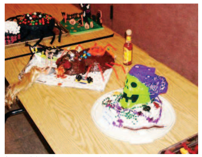
Some of the cake contest entries.