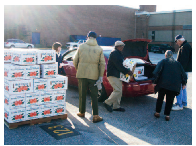
Fruit sale loading in the Severna Park High School parking lot.