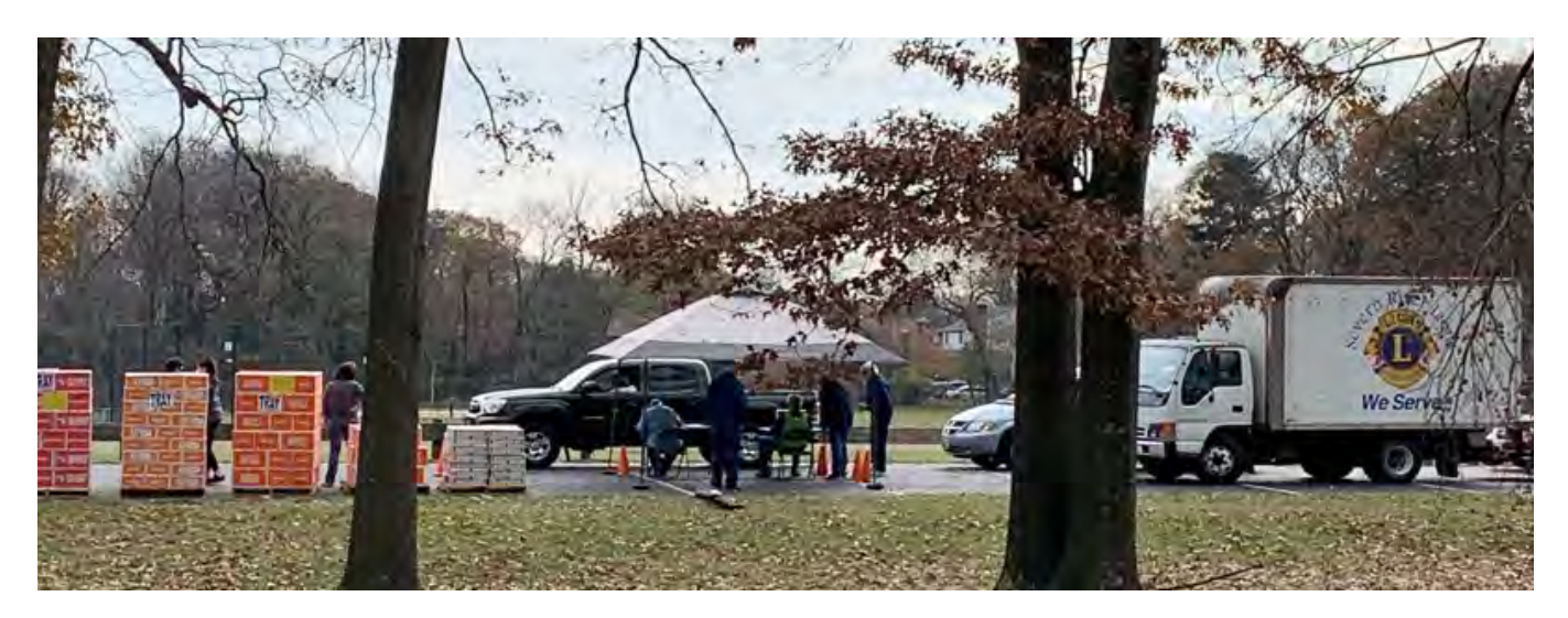
SRLC Fruit Sale Nov 2020 at Cypress Creek Park