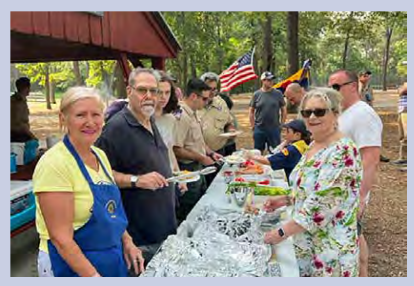
Severn River Lions and Scout Leadership grillling togther.