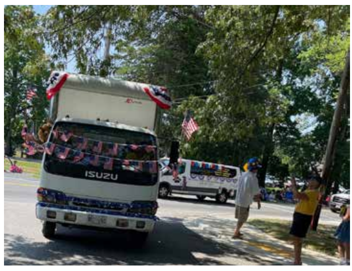
Fully decorated Severn River Lions Club Truck prepared for duty.