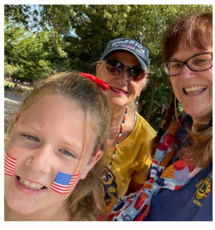
Severn River "Popsicle Detail" prepares for distribution with smiles.