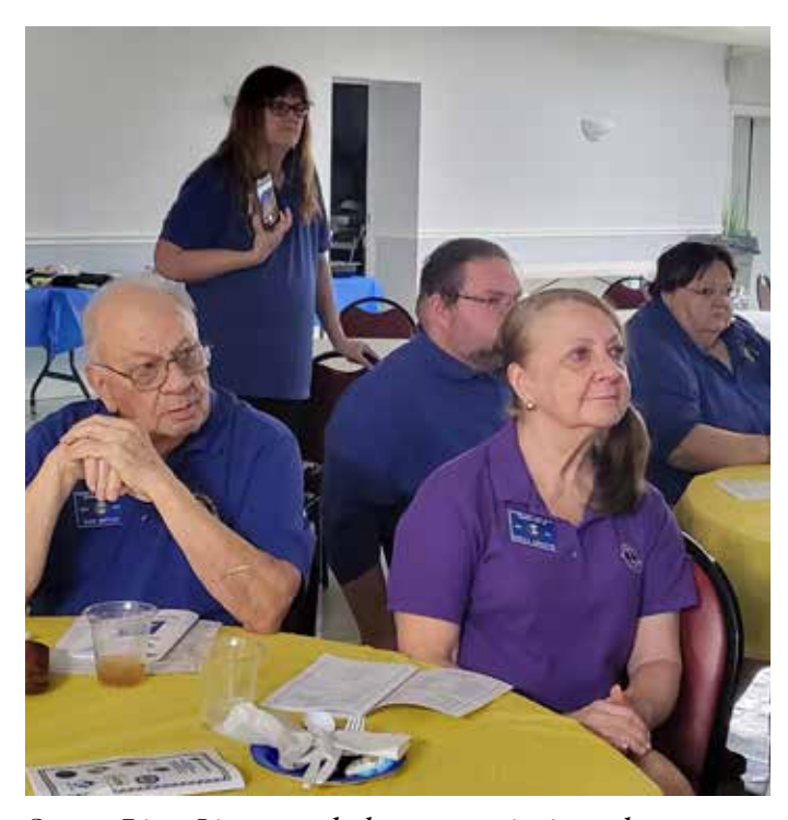
Severn River Lions watch the ceremonies intently.