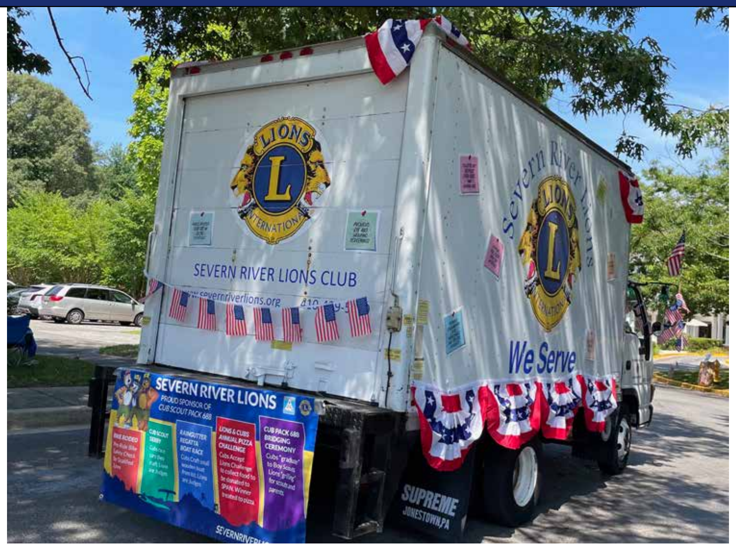
Fully\ decorated\ Severn\ River\ Lions\ Club\ Truck\ exhibits\ flag,\ post-it\ notes,\ and\ banners.