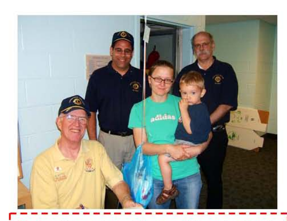
Severn River Lions with one of their "victims"