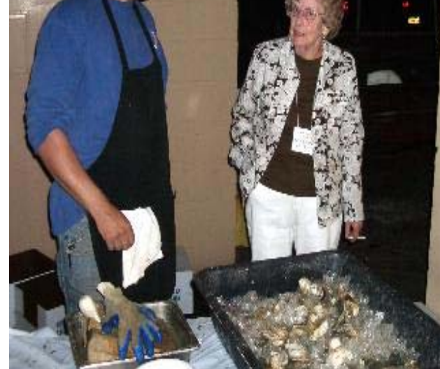
Bull and Oyster Roast Photos