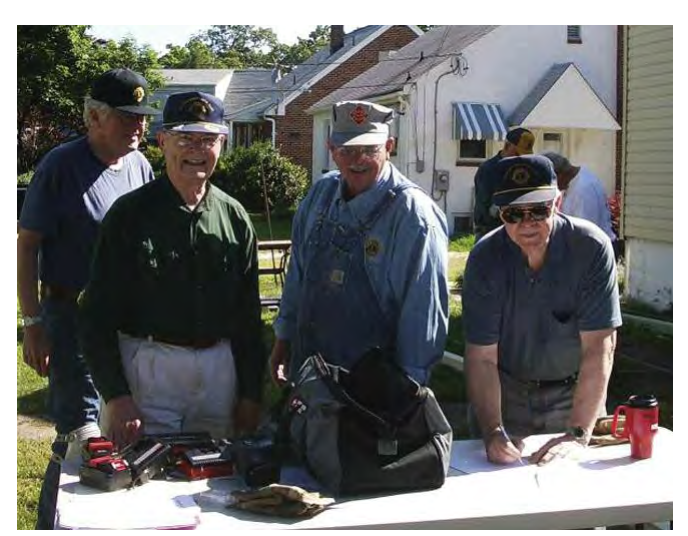
SRLC Ramp designers discuss the project.