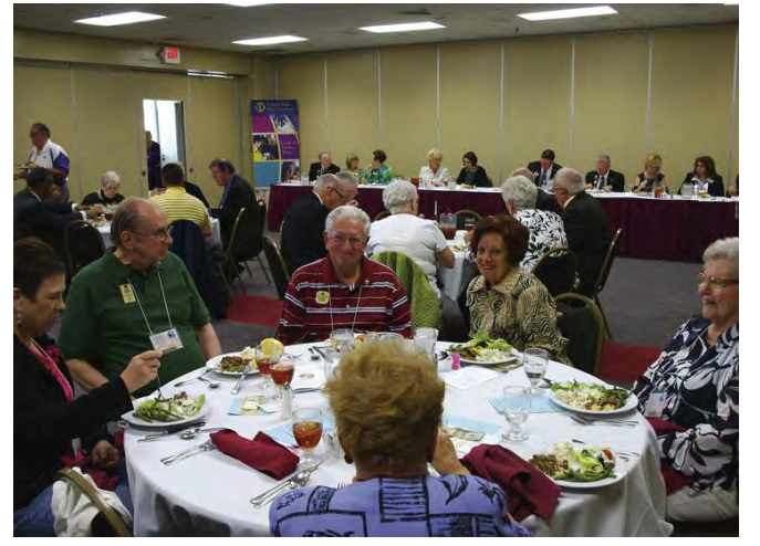
SRLC Lions enjoying the dinning and fellowship.