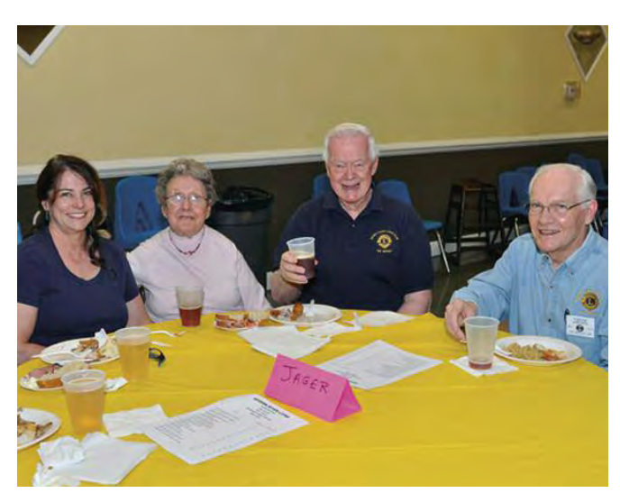
Good food and fellowship at the Jager table.