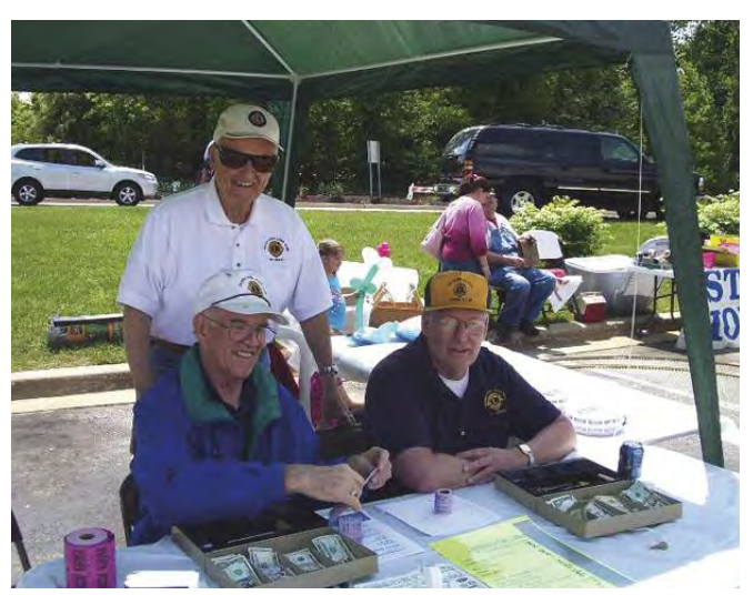
SRLC Lions provided ticket sales service for the event.

The Camp Blaze Children's Fair has been an SRLC activity for at least a decade and the club expects to be invited back again next year.