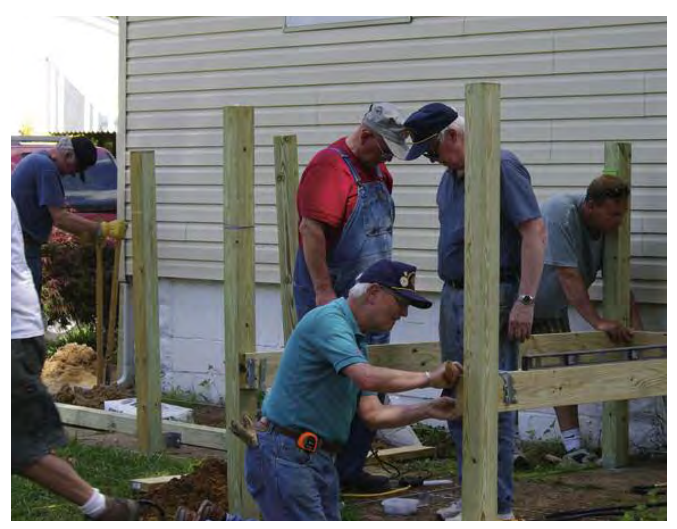
The ramp begins to take shape.