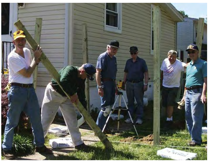
Construction progresses as Lions set the ramp posts.