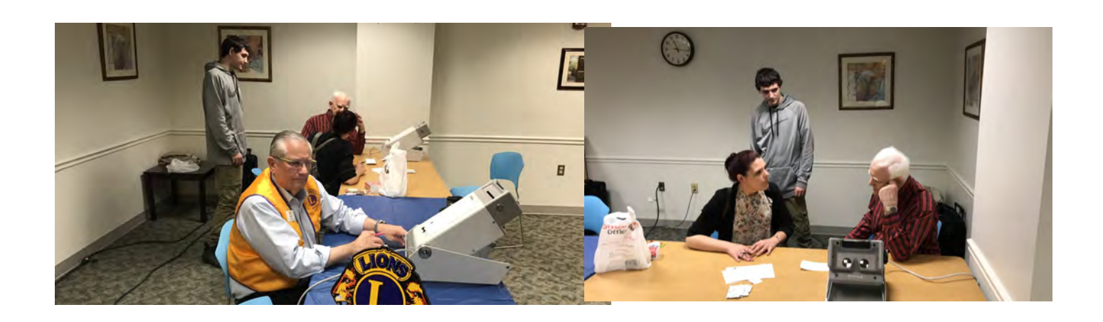
Eye Glass Screening at AA Community College Health Fair