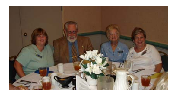
While our friends from East Anne Arundel are anticipating the celebration of their 60^{th} Anniversary.